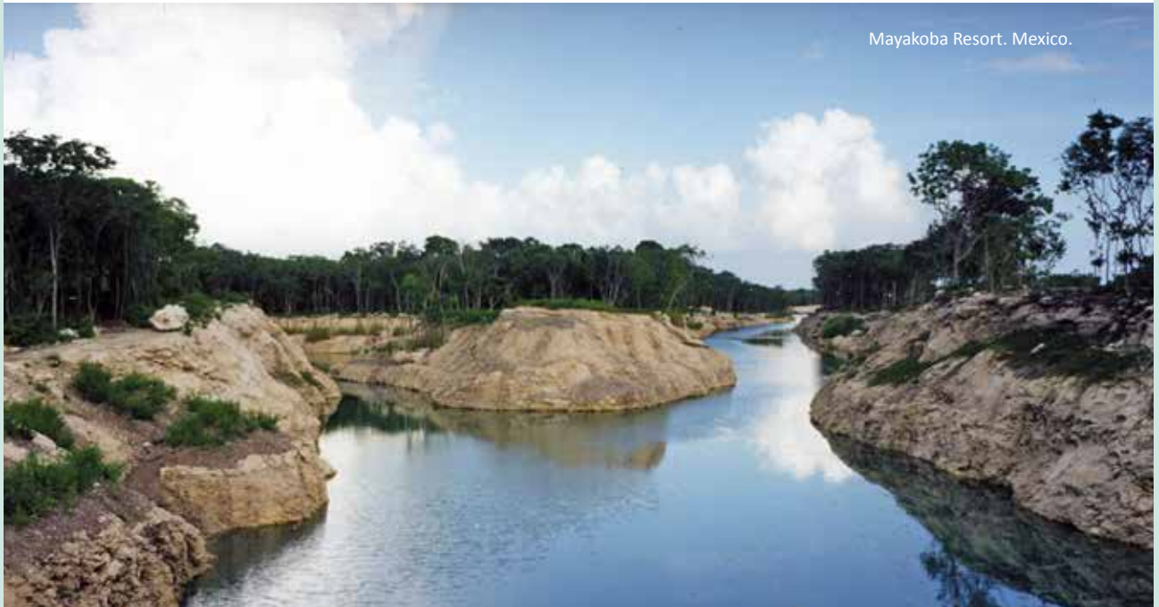
Mayakoba Resort. Mexico.

Mayakoba in Mexico should also be highlighted, a first-class coastal resort that stands out for its avant-garde approach to sustainability, making it a global benchmark. The actions carried out on this tourist development have earned it important recognitions and awards from the World Tourism Organisation (WTO) and the Rainforest Alliance, the highest awards of these two organisations: Ulysses and Sustainable Standard-Setter, respectively.