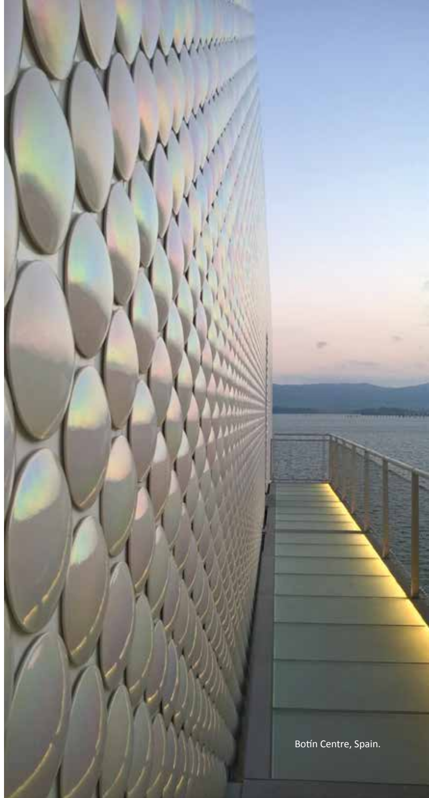
Botín Centre, Spain.