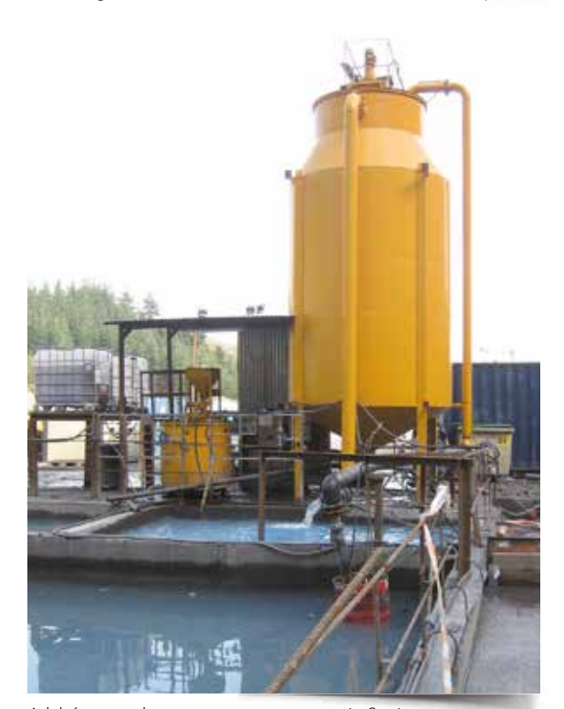
Arlabán tunnel water treatment system, in Spain.