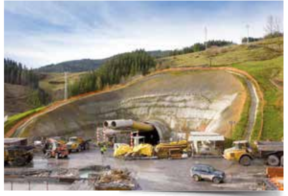
Zumárraga tunnel embankment after the restoration, in Spain.