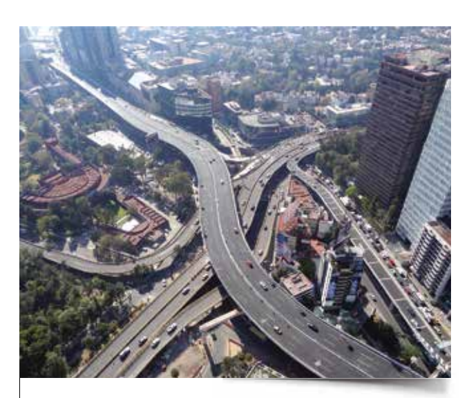
Client: Autopista Urbana Norte, S. A. de C. V. Completion date: 2013 Budget: 346.0 million euros

Construction of 8.9 km of elevated high specification urban viaduct with six lanes, built from prefabricated elements, as well as a 0.8 km double height false tunnel type depressed section connecting the north of the Bicentenial Viaduct of the State of Mexico to the south with the second level of the City of Mexico (Toreo-San Antonio). It has a dynamic monitoring system integrated in several points of the structure which permits real time knowledge of its behaviour in a seismic event.