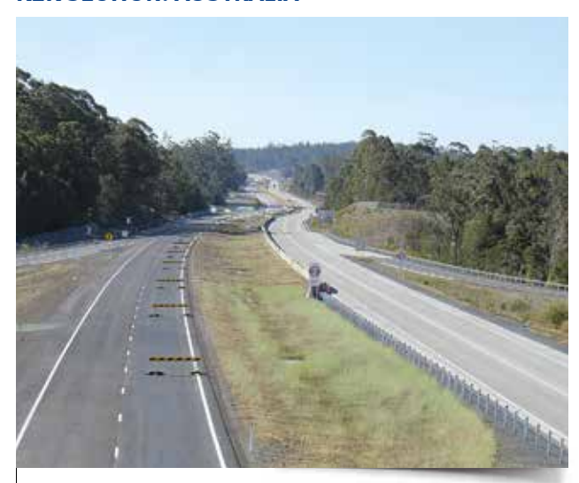
Client: Department of Roads and Maritime Services of New South Wales Completion date: 2017 Budget: 190.0 million euros

Construction of a 14 km section of one of the most important highways in Australia, the Pacific Highway, in the state of New South Wales, between the localities of Kundabung and Kempsey.