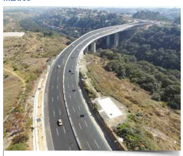
Client: Coordinadora Vía Rápida Poniente S. A. P. I. de C. V. Completion date: 2013 Budget: 161.7 million euros

Construction of 7.1 km of high specification urban highway, flexible pavement with six and four lanes, connecting the south with the west of Mexico City (Autopista Urbana Sur-Santa Fe). It was designed taking into consideration the preservation of the protected natural areas and the environmental value of La Loma and Río Becerra.