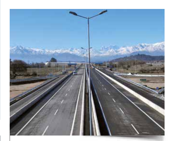
Client: Sociedad Concesionaria Autopista de los Andes Completion date: 2012 Budget: 360.0 million euros

Construction of 110 km of roadway along Route 60, one of the most important highways in the country, located in the Bioceanic Corridor, and it is an important connection between Chile, Argentina, Brazil and Uruguay.