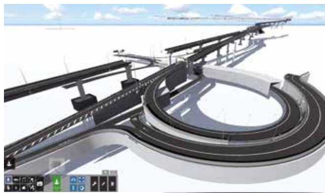
Example of the use of BIM in civil works: Américo Vespucio Oriente Project (Chile).

RDI constitutes one of the main growth pillars of OHLA due to its contribution to improving productivity and competitivness through the development of innovative solutions.